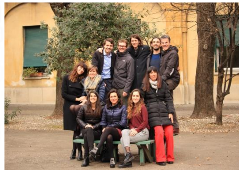
The Pavia University team (above); the project partners (below)

This project has received funding from the European Union's Horizon 2020 research and innovation program under grant agreement No 825215